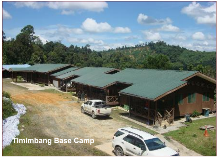
Timimbang Base Camp