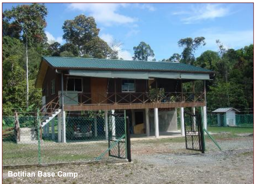
Botitian Base Camp