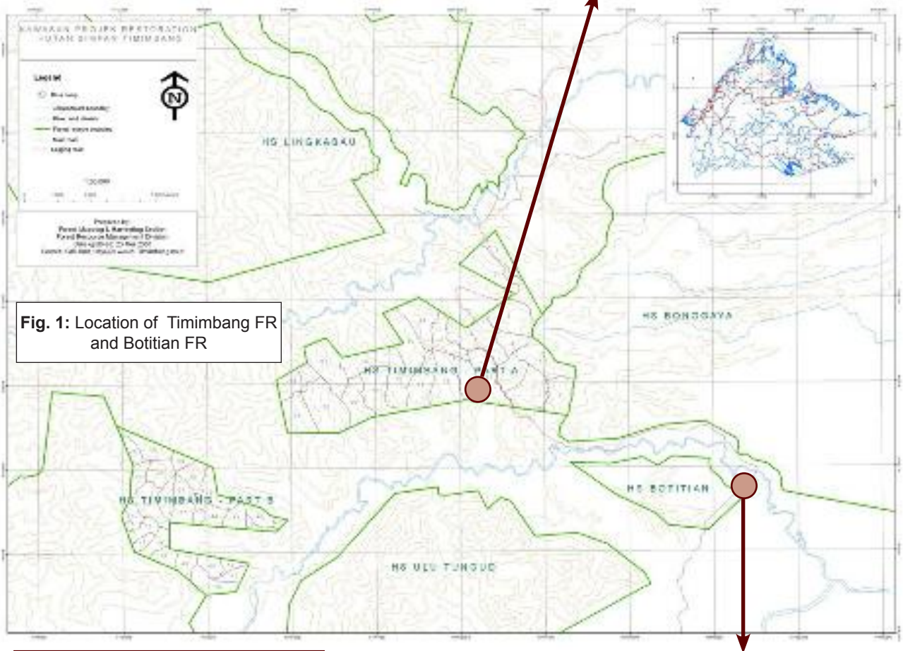
Fig. 1: Location of Timimbang FR and Botitian FR