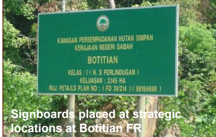
Signboards placed at strategic locations at Botitian FR