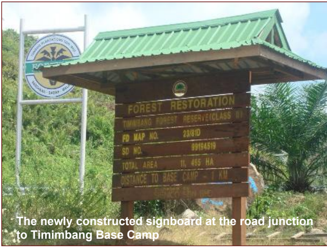
The newly constructed signboard at the road junction to Timimbang Base Camp