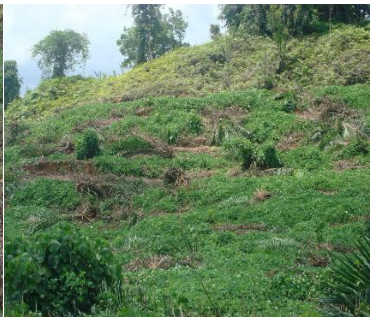
(Left and right) Illegal oil palm trees being destroyed inside Timimbang FR (Part B)