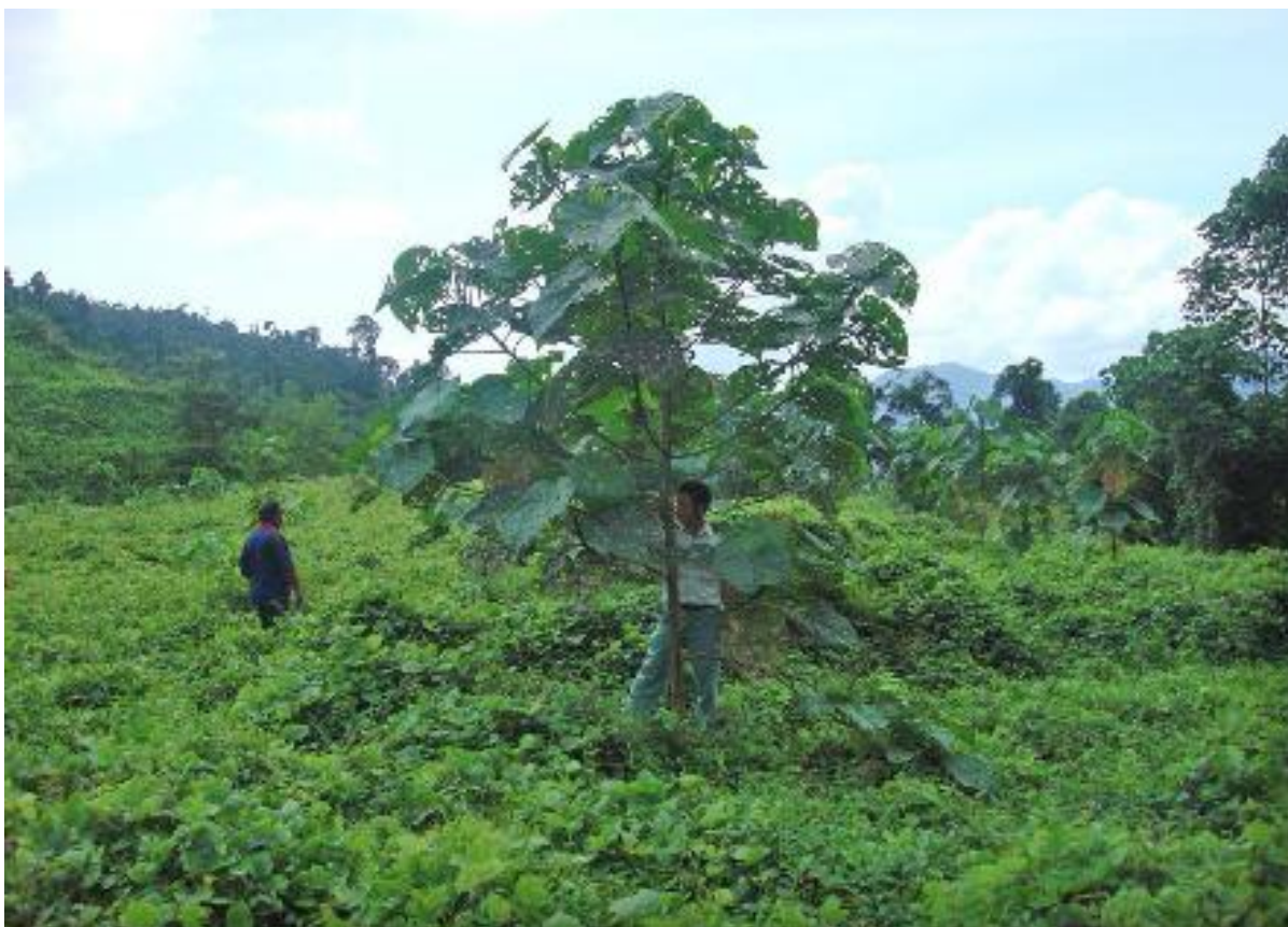
The planting of Binuang - Octomeles Sumatrana at the roadside (along Nangoh - Pitas Road) in Timimbang FR

The Management Committee is entrusted to prepare a 10-year Forest Management Plan for the Timimbang and Botitian Forest Reserves. This FMP will be prepared over a 2-year period, starting from next year. In the meantime, information gathering, forest stratification and compartmentalizing, annual work plan preparation and so on, are in progress. The thrust of the FMP will be on forest restoration.